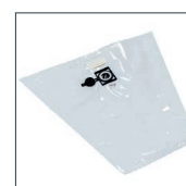
3.8023.118138 Subject to change